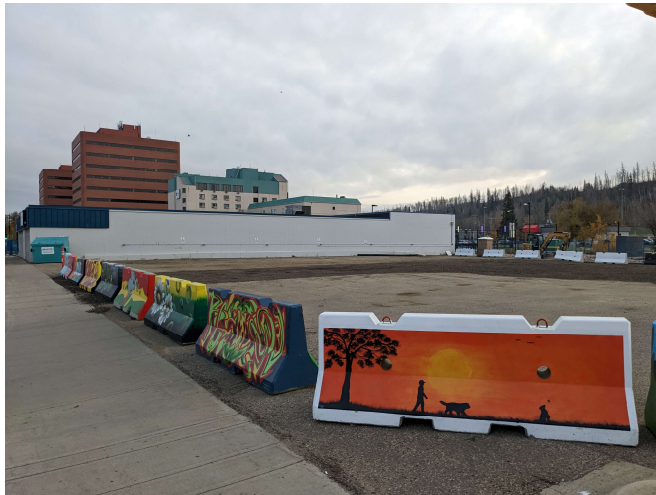
Keeping Downtown Cool