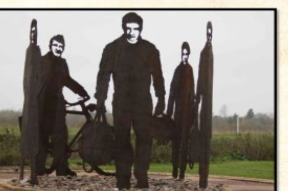
Example for illustration purposes only