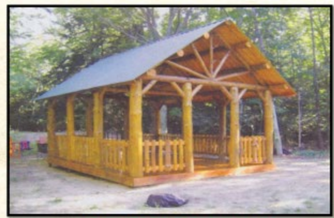
Example for illustration purposes only