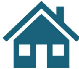
Rapid Re-housing (RRH)