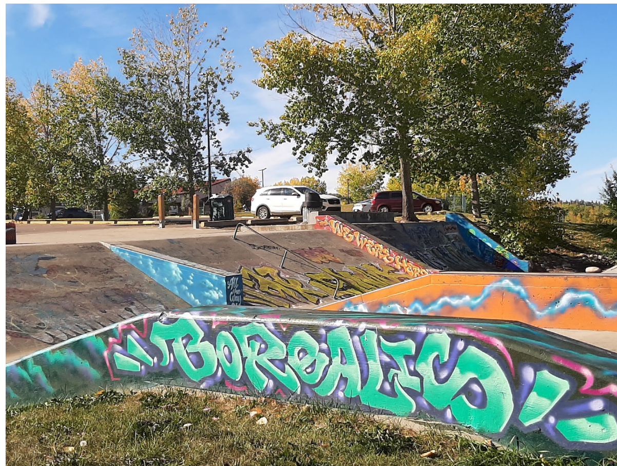
Attachment: Public Art Update (Public Art Update)