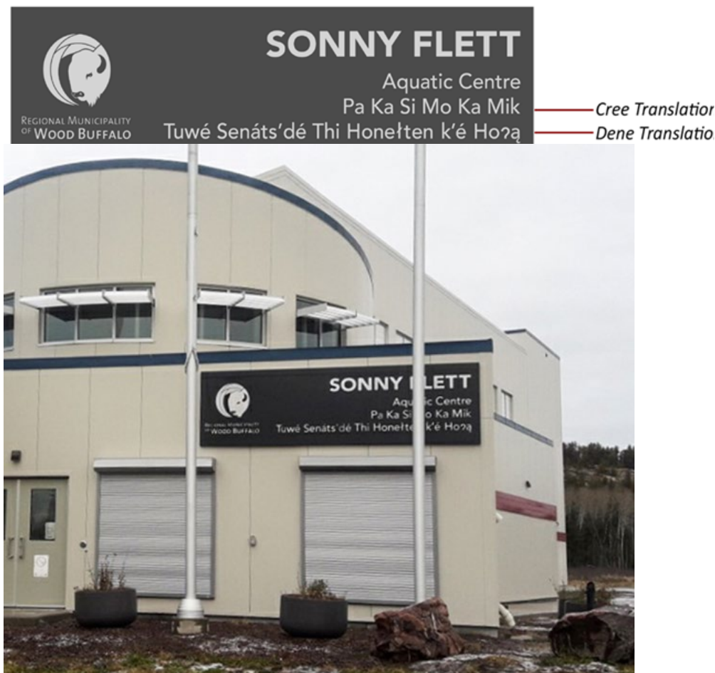
EXAMPLE OF EXTERIOR FACILITY SIGNAGE TRANSLATION AND INSTALLATION

Attachment: Facilities Updates (Facilities Update)