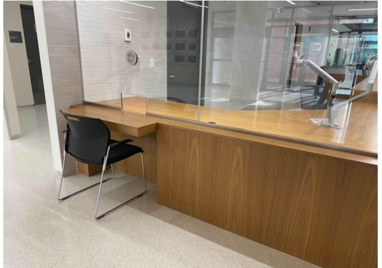
Attachment: Facilities Updates (Facilities Update)