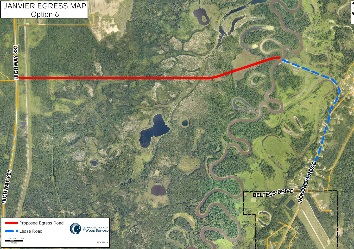
Attachment: 2. Janvier Egress Road Alignment (Rural Egress Roads)