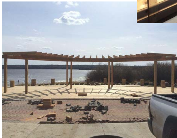
Gregoire Lake Estates