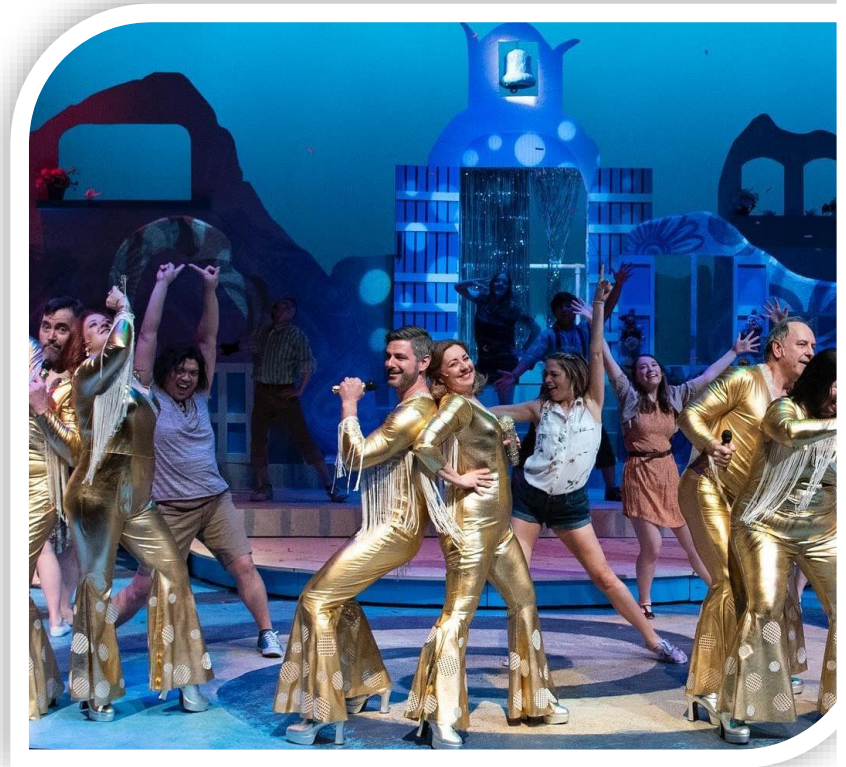
For the Love of Live - Keyano Theatre