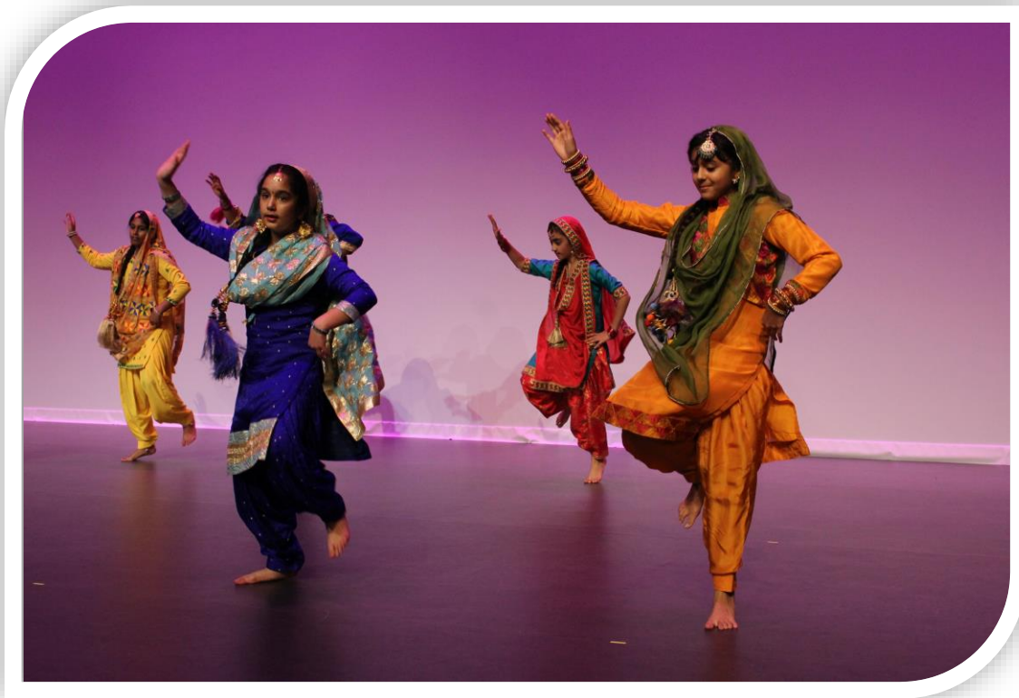
Punjabi Dance Group at World Meets Wood Buffalo

A document that is reflective of the need for cultural spaces and infrastructure in the region.