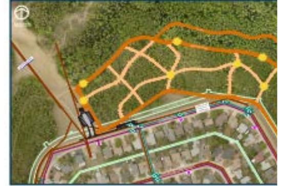
Rough outline of proposed site, located off of Cornwall Drive in Thickwood