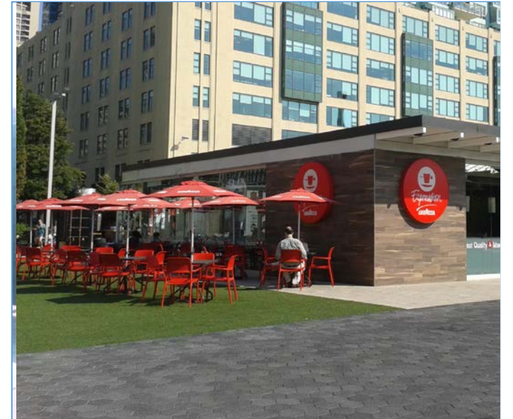
Patio projects (1)