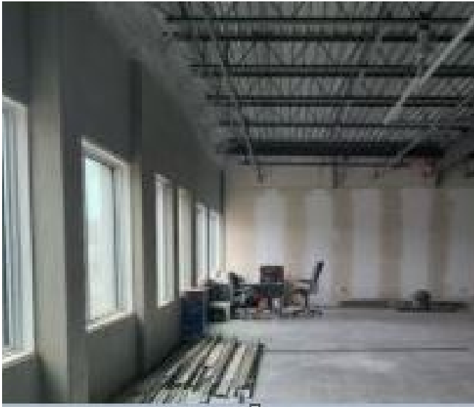
Interior projects (9)