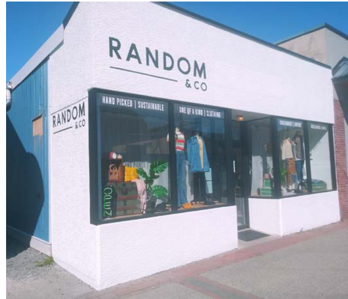
Façade projects (4)